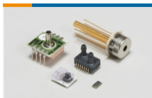
Board Level Pressure Sensors(1)